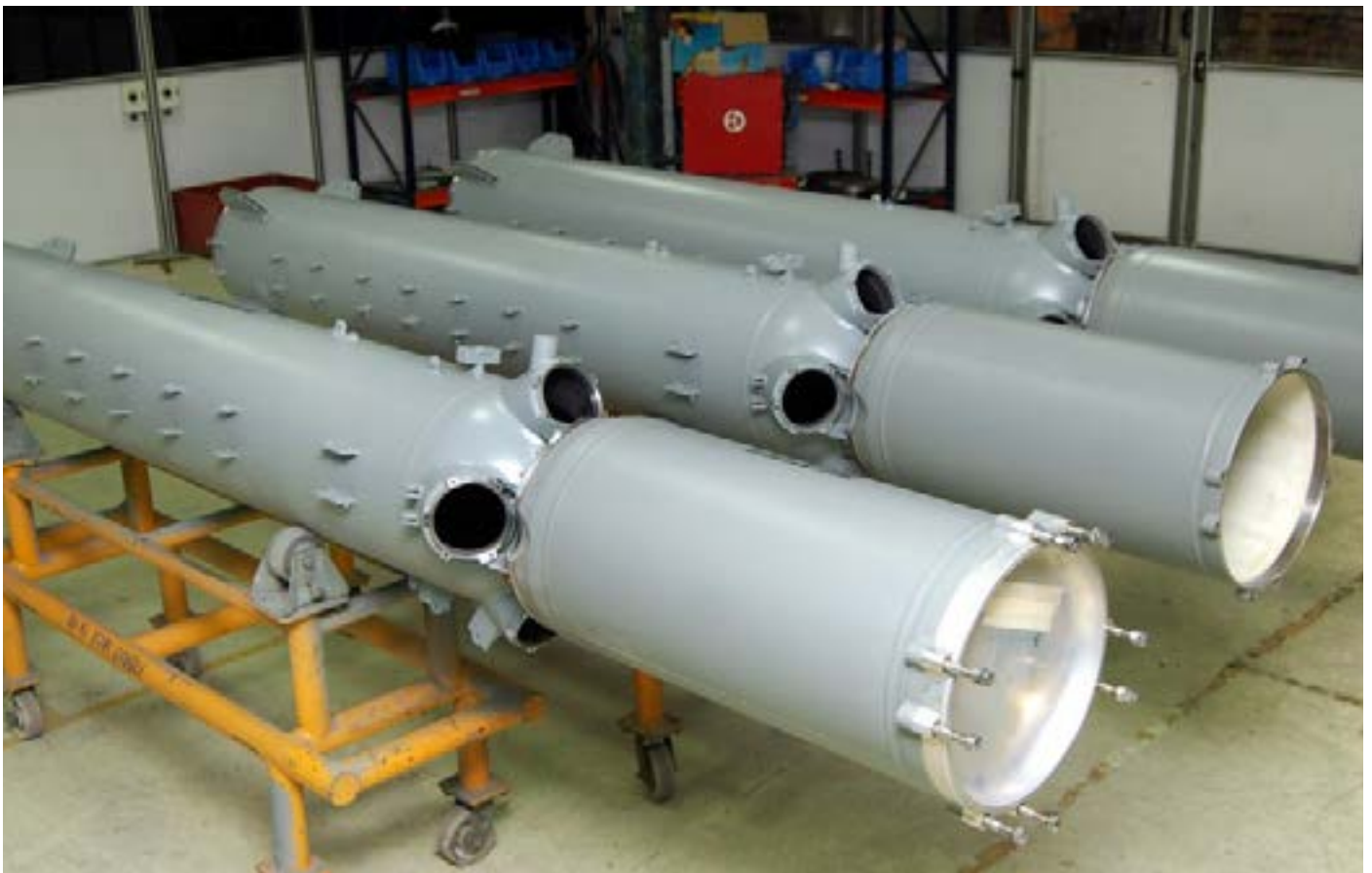
Walchandnagar Industries missile motor casing

Los Alamos National Laboratory and Sandia National Laboratory (operated by Honeywell) are “[t]he design and engineering labs for the W88 Alt 370”. 83 The W88 is the nuclear warhead deployed on the Trident II (D5) missiles. 84 The conventional high explosives and final assembly of the complete warhead takes place at the Y-12 and Pantex Plants (operated by Bechtel National, Inc., Leidos, ATK Launch Systems (a subsidiary of Northrop Grumman) and, SOC LLC 85 ) and the gas transfer system and the arming, fuzing, and firing subsystem is produced at the National Security Campus (NSC) (formerly Kansas City Plant) operated by Honeywell International. 86 The NNSA estimates that the costs for this system will be around $2.7 billion. 87